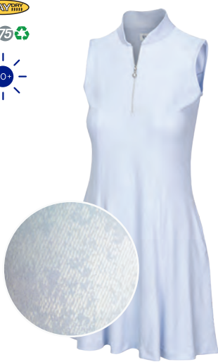
ML75 BRILLIANCE S/L ZIP FLARE DRESS 100% RECYCLED POLYESTER INTERLOCK

Sling mock collar, Pearl zipper pull, Glazed distressed twill print, 2 front pockets, 1 back pocket, Seamless short with Shark logo drawstring bag MSRP $119.95 / GNCW5995