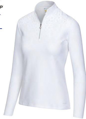
SOLAR XP JEWEL L/S ¼ ZIP POLO 89% POLYESTER / 11% SPANDEX SCUBA JERSEY

Sling mock collar, Pearl zipper pull, Front pearl trim detail, High-low hem, Reflective Solar XP logo on left hem MSRP $85.95 / GNCW4295