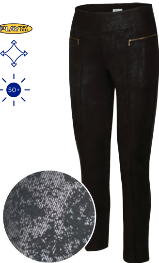
ELITE PULL-ON STRETCH ANKLE PANT 93% POLYESTER / 7% SPANDEX TWILL

28" inseam, Glazed distressed twill print, Ankle pant with slit detail, 2-front antique brass zipper pockets, 1 back pocket, Tummy control, PlayDry stretch pocketing MSRP $99.95 / GNCW4995