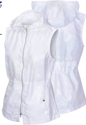
SOUTH SEA CIRÉ HOODED VEST 100% POLYESTER CIRÉ

Hooded vest, Pearl enameled signature Shark Tooth zipper pull, Snap pockets, 2-way zipper, Vented back MSRP $89.95 / GNCW4495