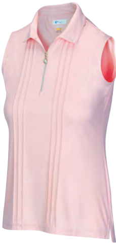
ML75 LUSTER S/L ZIP POLO 100% RECYCLED POLYESTER INTERLOCK

Tailored collar with pearl trim, Allover shimmer print, Pearl zipper pull, Front pintuck detailing, High-low hem MSRP $69.95 / GNCW3495