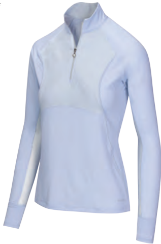
SOLAR XP FRESHWATER L/S ¼ ZIP POLO 92% POLYESTER / 8% SPANDEX TEXTURED JERSEY

Mock collar, Quilted shimmer print front yoke with piping, Mesh insets on sleeves, Thumb hole cuffs, High-low hem, Reflective Solar XP logo on left hem MSRP $85.95 / GNCW4295