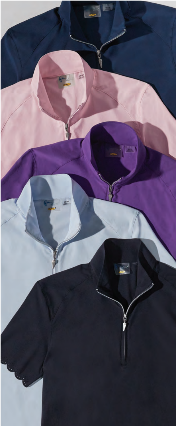
G2F20W520 X-LITE 50 S/S ZIP POLO 88% POLYESTER / 12% SPANDEX WOVEN Mock collar, Shark tooth zipper pull, Laser cut scalloped sleeve and bottom hem MSRP $69.95 / GNCW3495