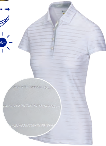
SHELL S/S POLO 92% POLYESTER / 8% SPANDEX CREPE

Tailored collar, Pearl buttons, Silver foil stripe print, Silver foil details MSRP $75.95 / GNCW3795