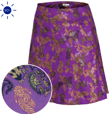
MAJESTIC PULL-ON KNIT SKORT 100% POLYESTER INTERLOCK

18" Length, Glazed paisley print, Flare skort, 2 front pockets, 1 back pocket, Breathable mesh short liner with ball pocket MSRP $79.95 / GNCW3995