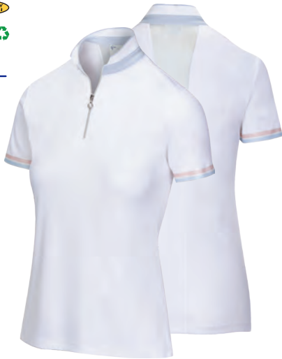
ML75 CHARM S/S ZIP POLO 100% RECYCLED POLYESTER INTERLOCK

Tipped knit collar, Contrast shimmer collar band and slits, Pearl zipper pull, Shimmer stripe tape cuffs, High-low hem, Mesh back inset MSRP $75.95 / GNCW3795