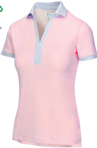
ML75 TREASURE S/S POLO 100% RECYCLED POLYESTER INTERLOCK

Tailored collar with pearl trim, Y-neck, Shimmer trim details, High-low hem MSRP $75.95 / GNCW3795