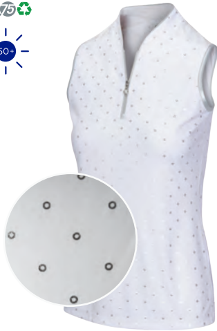
ML75 PEBBLE S/L ZIP POLO 100% RECYCLED POLYESTER INTERLOCK

Tulip collar, Mini silver foil circle print, Pearl zipper pull, Shimmer trim details MSRP $69.95 / GNCW3495