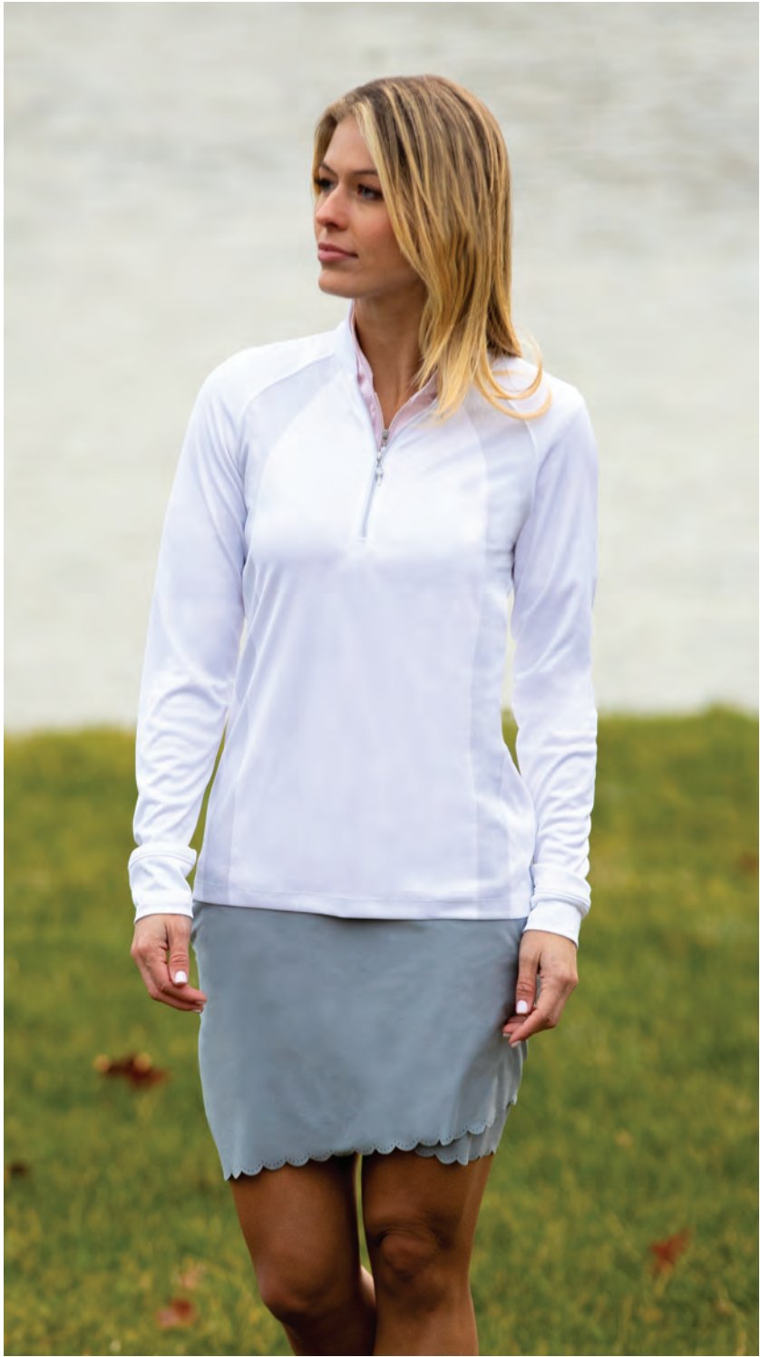
G2F20K499 L/S ZIP TONAL PLACEMENT PRINT POLO 100% POLYESTER INTERLOCK

Sling mock collar, Shark tooth zipper pull, Tonal placed micro grid print, High-low hem MSRP $79.95 / GNCW3995