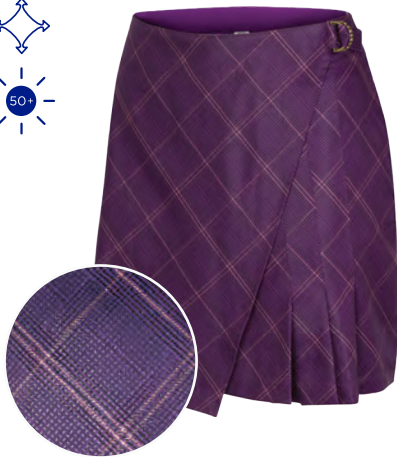
REGAL PULL-ON 4-WAY STRETCH SKORT 93% POLYESTER / 7% SPANDEX TWILL

18" Length, Glazed Glen Plaid print, Faux wrap pleated skort with left waist antique brass buckle, 2 front pockets, 1 back pocket, Breathable mesh short liner with ball pocket MSRP $79.95 / GNCW3995