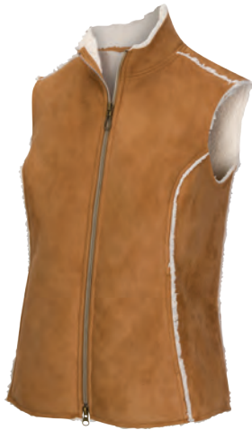
SUPERIOR SHERPA VEST 100% POLYESTER FLEECE

Antique brass rope zipper pull, Raw seam detail, 2-way zipper, Shirt tail hem MSRP $99.95 / GNCW4995