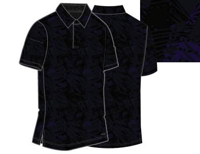
G7F7K522 TROPICAL PRINT POLO 54% PIMA COTTON / 43% MICROPOLYESTER / 3% SPANDEX JERSEY Tailored collar, Moisture wicking, Embossed Shark logo patch on left hem, UPF 50+ MSRP $79.00 / GNCW3950