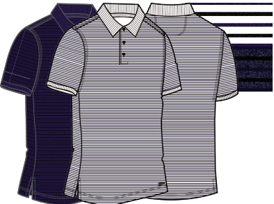
G7F7K524 YARN DYE STRIPE POLO 54% PIMA COTTON / 43% MICROPOLYESTER / 3% SPANDEX JERSEY Knit collar, Moisture wicking, Embossed Shark logo patch on left hem, UPF 50+ MSRP $75.00 / GNCW3750