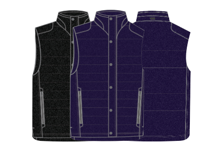
G7F7J620 FEATHERWEIGHT QUILTED VEST 65% POLYESTER / 35% NYLON WOVEN Water repellent, Heathered fabric, Embossed Shark patch on back neck MSRP $99.00 / GNCW4950