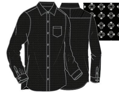
G7F7W320 L/S PRINTED WOVEN SPORT SHIRT 93% POLYESTER / 7% SPANDEX STRETCH WOVEN Tailored collar, Moisture wicking, Embossed Shark patch under front placket, UPF 50+ MSRP $89.00 / GNCW4450