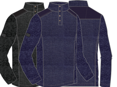
G7F7K920 FABRIC-BLOCKED 1/4-ZIP PULLOVER 100% POLYESTER SWEATER FLEECE Water repellent, Embossed Shark logo patch on right bicep, UPF 50+ MSRP $89.00 / GNCW4450