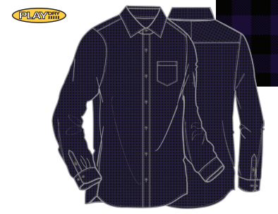
G7F7W321 L/S YARN DYE CHECK SPORT SHIRT 93% POLYESTER / 7% SPANDEX STRETCH WOVEN Tailored collar, Moisture wicking, Embossed Shark patch under front placket, UPF 50+ MSRP $89.00 / GNCW4450