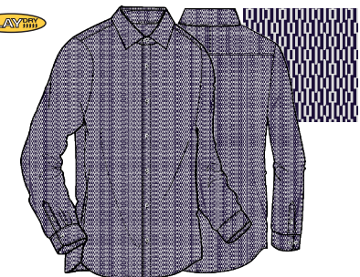
G7F7K923 L/S KNIT SPORT SHIRT 100% POLYESTER JACQUARD Tailored collar, Moisture wicking, Embossed Shark patch under front placket, UPF 50+ MSRP $89.00 / GNCW4450