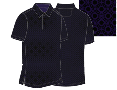
G7F7K521 DOT PRINT POLO 54% PIMA COTTON / 43% MICROPOLYESTER / 3% SPANDEX JERSEY Tailored collar, Moisture wicking, Embossed Shark logo patch on left hem, UPF 50+ MSRP $79.00 / GNCW3950