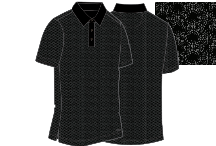
G7F7K523 GEO PRINT POLO 54% PIMA COTTON / 43% MICROPOLYESTER / 3% SPANDEX JERSEY Tailored collar, Moisture wicking, Embossed Shark logo patch on left hem, UPF 50+ MSRP $79.00 / GNCW3950