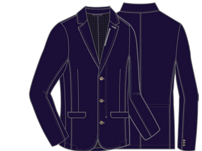
G7F7J621 PERFORMANCE OUTERWEAR BLAZER 97% POLYESTER / 3% SPANDEX TWILL Water repellent, Stretch, Check lining, Button and zip front, Zip pockets MSRP $149.00 / GNCW7450