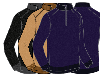
G7F7S122 LUXURY BLEND 1/4-ZIP SWEATER 55% COTTON / 25% VISCOSE / 15% POLYESTER / 5% MERCERIZED WOOL Luxurious handfeel, Fully fashioned, Performance blend, Easy care MSRP $89.00 / GNCW4450