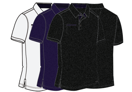
G7F7K520 HEATHERED POLO 54% PIMA COTTON / 43% MICROPOLYESTER / 3% SPANDEX JERSEY Tailored collar, Moisture wicking, Embossed Shark logo patch on left hem MSRP $79.00 / GNCW3950