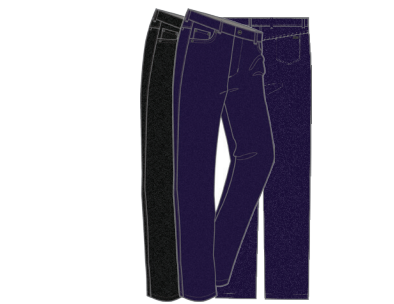
G7F7P520 5-POCKET HEATHERED PANT 100% POLYESTER TWILL Stretch shirt gripper waistband with logo, Embossed Shark logo patch on back right pocket, UPF 50+ MSRP $85.00 / GNCW4250