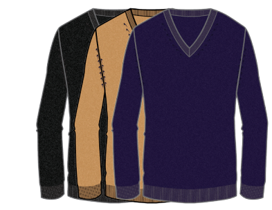
G7F7S120 LUXURY BLEND V-NECK SWEATER 55% COTTON / 25% VISCOSE / 15% POLYESTER / 5% MERCERIZED WOOL Luxurious handfeel, Fully fashioned, Performance blend, Easy care MSRP $89.00 / GNCW4450